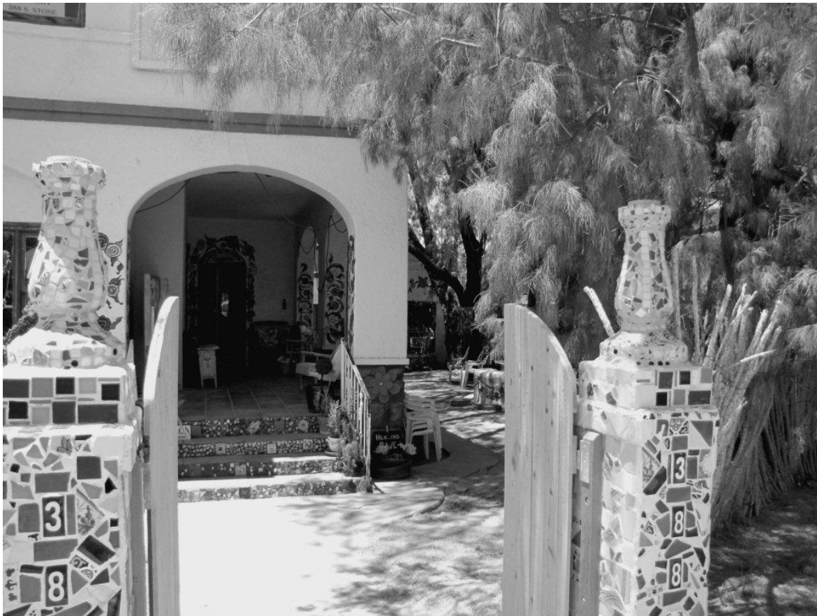
Entrance to The Castle